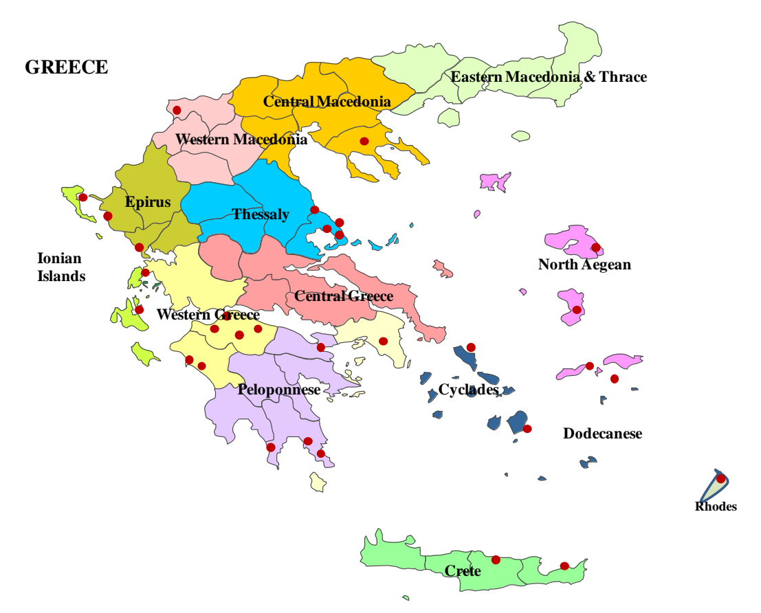
MAP 1. Geographical Distribution of the Units of the Study

The survey was conducted during the period March - April 2012, when seasonal operating hotels start working. A structured questionnaire was distributed in each unit; the questionnaire was based on questions arising from the pilot survey. The questionnaires were distributed to managers of the units or people who, due to their post, regularly confront events that threaten safety. The sample has specific characteristics due to the reservations of some managers to make public such kind of incidents. For this reason, the sample was a "convenience sample" so that it had to be combined with personal interviews with managers. Respondents answered both in open and closed questions. The questions posed were related to the manifestation of delinquency cases, their type, the way of confronting them, the personnel responsible for their management, the existence or not of relative staff training, the employment of security officers (Groenenboom & Jones, 2003; Gill-Moon-Seaman & Turbin, 2002), the involvement or not of the police, the communicative handling of these cases, etc. Each interview lasted approximately 60 minutes.